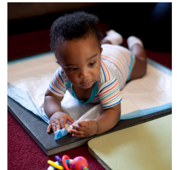
Tummy time takes practice