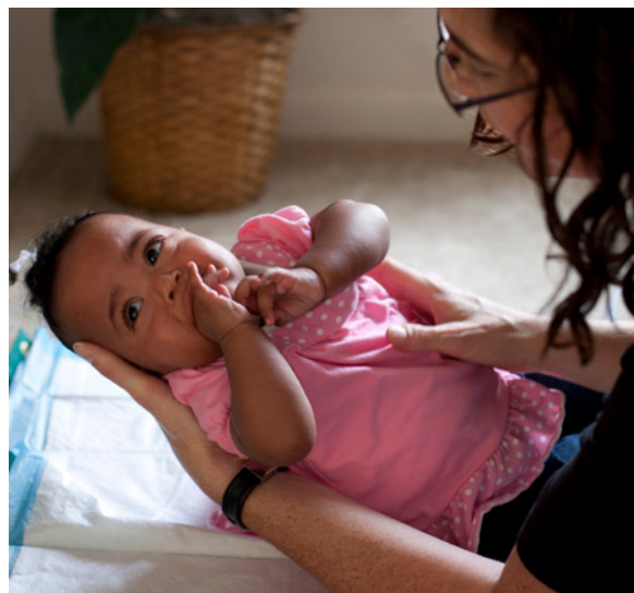
Not Ready to Play: Baby is over stimulated and looking away