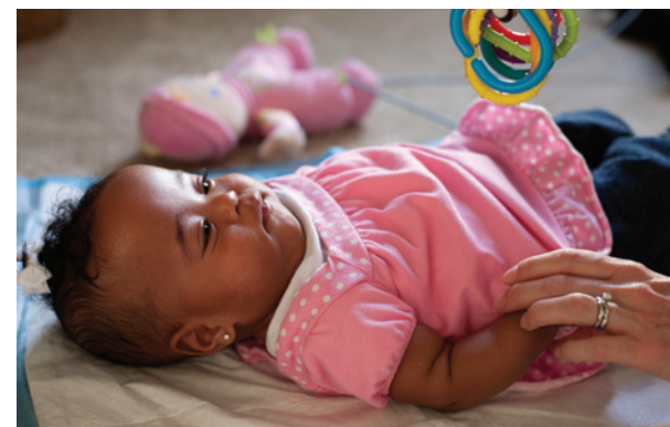
Ready to Play: Baby is relaxed and looking at a toy