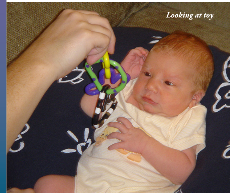
Looking at toy

This is your baby's adjusted age right now.